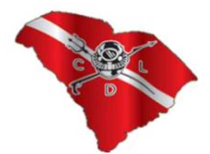
****** Seven Star Liquors